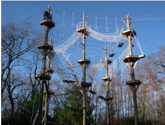
Proposed ropes course at Camp Highroad.

lodges full - even in January and February. In September 2011, CH stepped into uncharted waters by hosting AwakeningFest , a two-day Christian music festival that draws roughly 10,000 people ( www.awakeningfest.org ). The event was phenomenal: spirit-filled, fun, muddy, loud, and very exciting. They'll be back in September 2012!